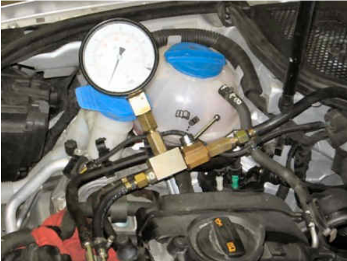
VAG 1318 gauge installed on a 2.0T FSI vehicle.